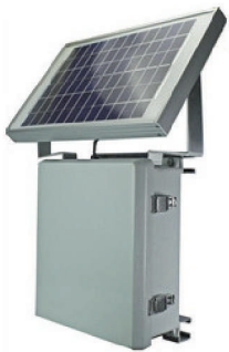
Solar Power Kit