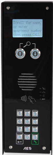
Sleek all-black panel with blue lighting.