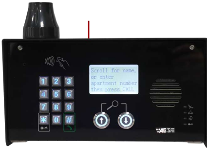
Pedestal unit - Full black panel with blue lighting.