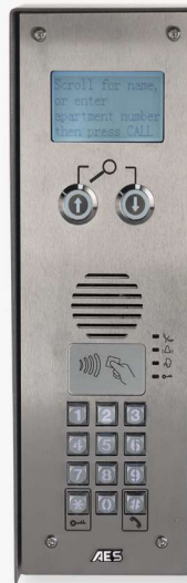
Full steel panel with white lighting.